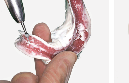
Check and adjust Ideal for metal crowns and bridges